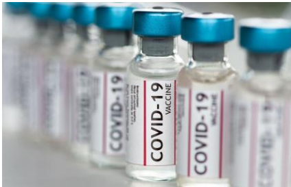
Bottles of COVID-19 Vaccine