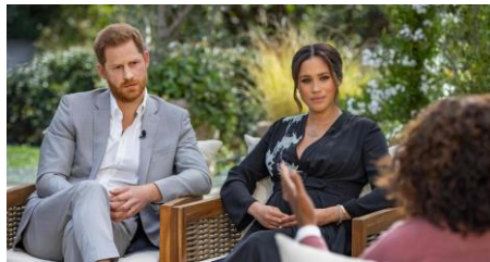
Meghan and Harry during the interview with Oprah

The couple revealed many personal details from the last few years, such as how stressful working as a royal was for Meghan and how their son,