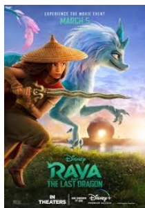
Disney's Raya and the Last Dragon

Movie streaming is not a new concept. In fact, Netflix began in 2007; however, in the last year during the Coronavirus pandemic, it was