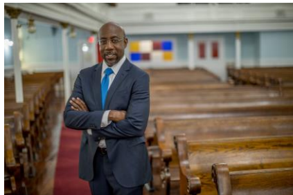
Rev. Raphael Warnock pictured in his church in Atlanta.

The first race called was the runoff for the special election between Rev. Warnock and Sen. Loeffler. Warnock won 50.8% of the votes. He will be the first African American Senator from